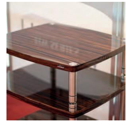
Indonesian Ebony Macassar (Gloss)