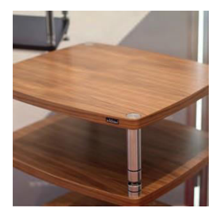
American Natural Walnut